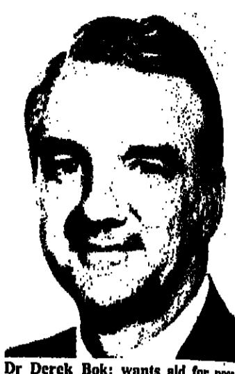
Dr Derek Bok: wants aid for poor

Some of the sweeping cuts in student grants and loans proposed by the Reagan administration were defended for the first time last week by one of America's leading university presidents.